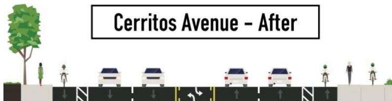
Painted bike lanes on both sides with a 3' wide buffer and a 6' wide off street bike path.