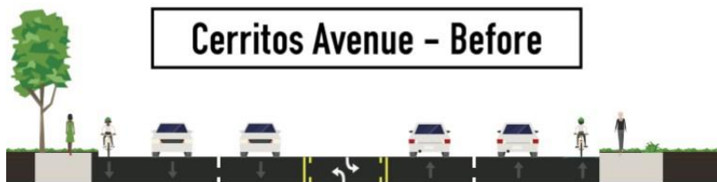
Bike route without a painted bike lane on both sides of Cerritos Avenue.

Cerritos Avenue Bike Corridor Improvements Project - The project is located in the City of Cypress and upgraded the previously existing Class III bike facility to a one-mile Class I bike facility on the south side of Cerritos Avenue as well as a Class II facility on both sides of Cerritos Avenue from Denni Street to Walker Street. The previous Class III facility along the project limits only designated the preferred route for cyclists on the street, which is not appropriate for roadways with high motor traffic speeds and volumes. The project provided a dedicated bikeway to promote continuity to the bikeway network and provide exclusive right-of-way for cyclists separate from the roadway that minimize cross flows by motor traffic. The project also maintained the existing pedestrian path which was separated using a landscaped buffer and reduces pedestrian-cyclist conflicts.