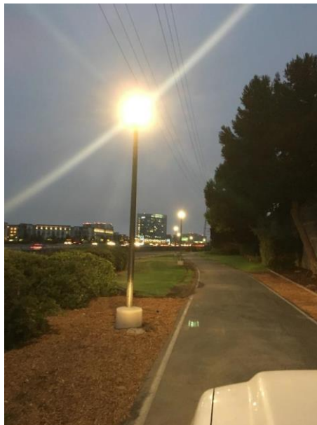
Trail Lighting Improvements

Prior to the implementation of this project there was no bicycle or pedestrian scale lighting within the project location. Although there were existing streetlights along parallel Main Street, the cyclists would have to share the road with vehicles travelling at speeds of up to 50 miles per hour if they chose that route. The project increases visibility and enhances safety.