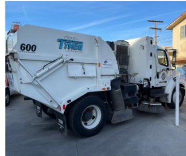
One of Gardena's near-zero emission street sweepers, funded in part by the MSRC's Local Government Partnership Program.