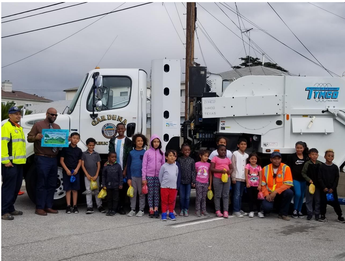
Figure 2: New CNG street sweeper on display at an event for Public Works Week